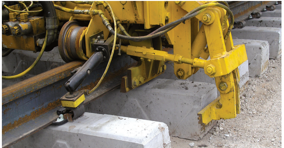
Clipping is carried out by a Nipper-Clipper mechanism on the New Track Construction Machine.