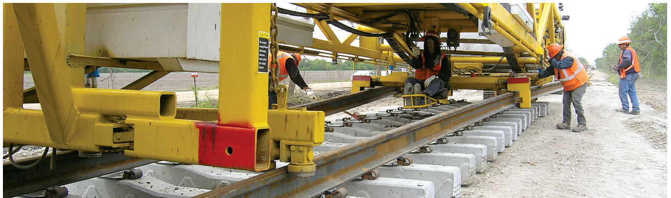
Rail Guide rollers suspended from the Laying Beam. Rails are guided into place on ties by an operator positioned below the beam.